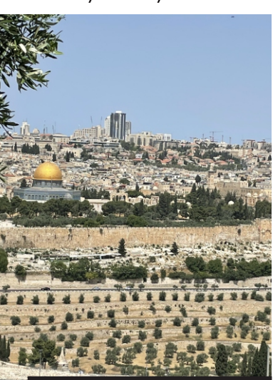
View from Mount of Olives toward Jerusalem

However, our greatest highlights were our times in His Word and